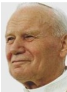
John Paul II