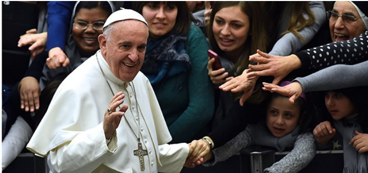
Pope Francis arrives for a special audience for the Cassano allo Jonio diocese at the Vatican on February 21, 2015.

Nine-in-Ten Catholics View Pope Francis Favorably, on Par With Ratings for John Paul II